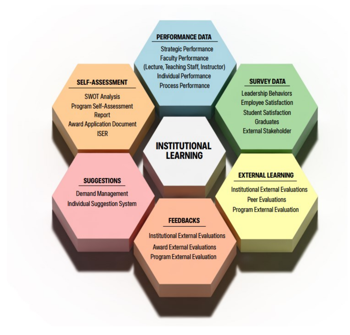
Figure 5.1. Assessment and evaluation model applied at Hacettepe University